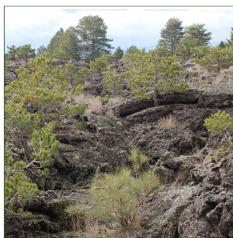
Figure 2 - The tree of pine shows its pioneer capabilities on lava.

The trunk can reach up to 40-50 m in height, is particularly straight with average diameters ranging between 65 and 80 cm but may grow up to 100 cm. Pine stands are