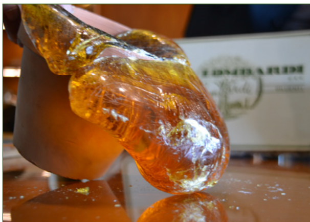
Figure 3 - The resin collected in terracotta jars.

In these documents, the name of the Lombardi Company operating in the pine forest in the 1950s was deduced. Interviews were conducted with those few people who came into contact, directly or indirectly, with such use of the forest. A meeting was also held with the current owner of the Lombardi company in Bientina, Pisa, where further historical information was retrieved.