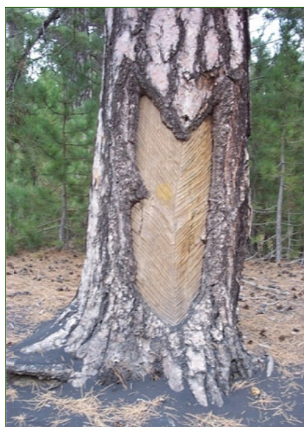
Figure 5 - Although in most cases the resination wound was almost completely encompassed by the bark, one can still see the typical fishbone incisions inclined at about 45° to the axis of the tree, traceable to the Mazek method.

Although overall forest management is generally poor, the silvicultural practices of Etna's foresters employed sophisticated techniques such as the use of long ladders to access the highest parts of the trees, cut side branches and obtain knotless trunks (La Mantia, unpublished). Until the mid-1990s, the Ragabo pine forest was the only one in Sicily classified as a selected forest for high-quality seed collection (Morandini and Magini 1975).