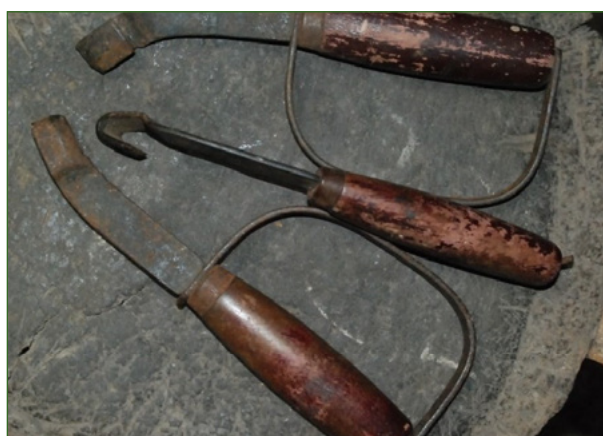
Figure 6 - Bark carving tools (scrapers).

Finally, it is significant that the Ragabo (Linguaglossa) larch pine forest was among the 21 old-growth forests officially recognized by the Sicilian Region in November 2024.