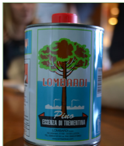
Figure 7 - The pine tree has always been the symbolic tree of the Lombardi company.

The rise in transportation costs and the general crisis in the forestry sector have made resin tapping increasingly less economically viable throughout Italy. As early as the 1970s, resin began to be imported from Greece, Portugal, and Spain. Nevertheless, in recent years, resin has found new applications, ranging from the pharmaceutical to the food industries.